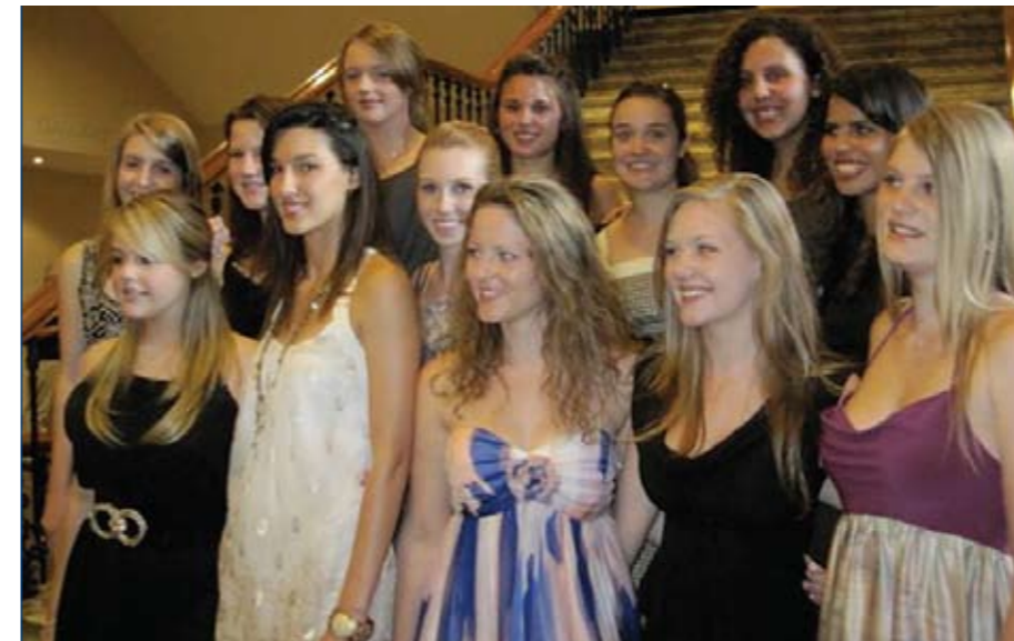
Some of the IB Merit Award recipients at the award ceremony Some of the SACE Merit Award recipients at the award ceremony